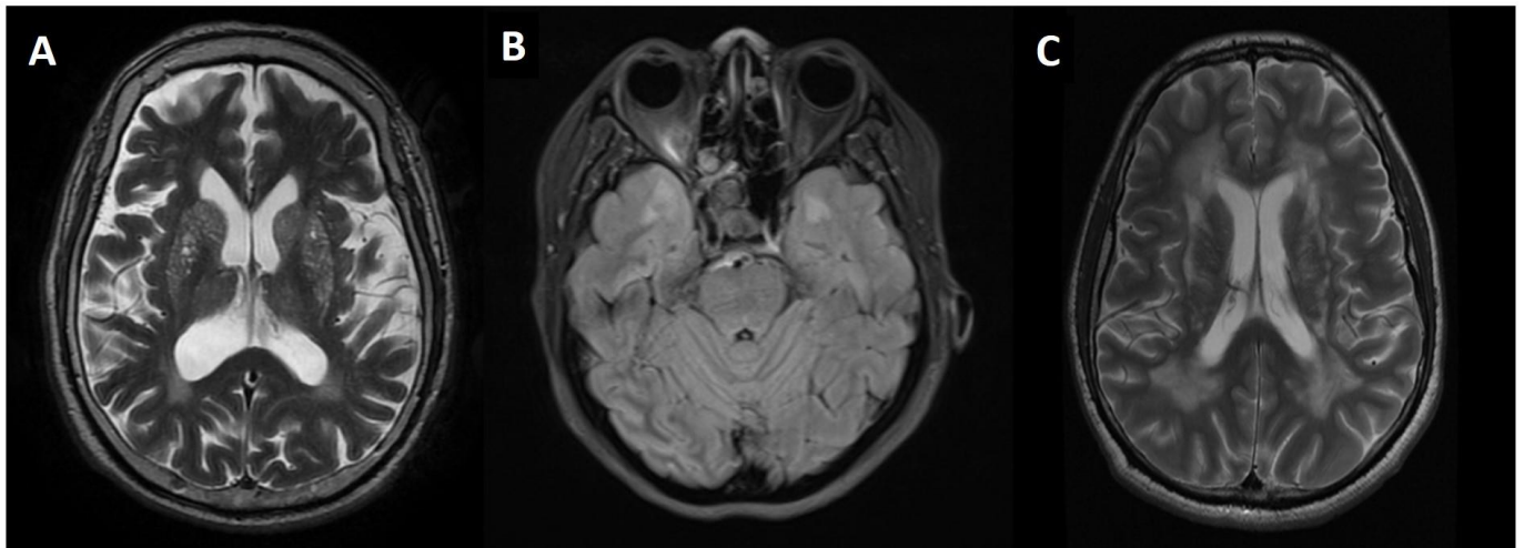
Figure 2. (A) Axial T2W MRI brain of case 1 demonstrates hyperintensities in caudate nucleus, lentiform nucleus. (B) Axial FLAIR sequence of case 3 demonstrates anterior temporal pole involvement. (C) Axial T2W MRI brain of case 4 demonstrates confluent deep white matter and periventricular lesions.